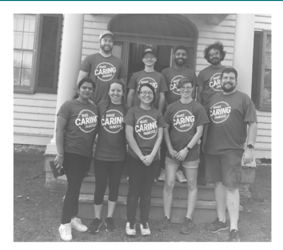
Thank you to the United Way Day of Caring volunteers from John Deere for their help doing a deep clean at the house and for fixing the touchscreen.