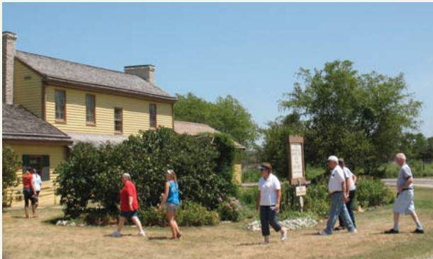
400 people visited the house on Saturday, July 7th during the island-wide open house for Rock Island Arsenal's 150th Anniversary.

The admissions and Sutlery sales were both up over the previous year and these extra visitors may have been part of the reason. Figures show that 1,700 people visited the house and that sales in the gift shop topped $1,550. The very reasonable admission fees make the Davenport House tours a real bargain.