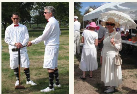
Almost $900 was raised during the new Colonel's Croquet Party on August 17th.