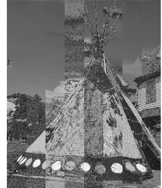
In August, the CDHF hosted its first Native American Culture Days.