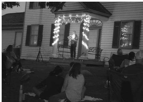
The CDHF held its Ghost Tales event on the warmest night in recent history (no coats needed!). We had three great storytellers, including one with paranormal experience.