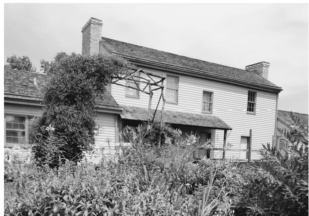
Thank you to the members of the Tri-City Garden Club for maintaining the historic garden at the house. It is the first thing visitors walk by and it is a beautiful welcome.