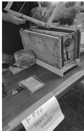
Pioneer Days brought its share of visitors and a new local honey opportunity.